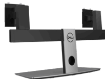
DELL DUAL MONITOR STAND | MDS19

Multipoint with integrated speakerphone offers an all-in-one connectivity and conferencing solution.