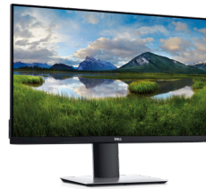
DELL 27 USB-C MONITOR | P2720DC

Easily attach your Dell Dock to the Dell Dock Mounting Kit and mount it behind a monitor, to a wall or under the desk for a clutter-free workspace.