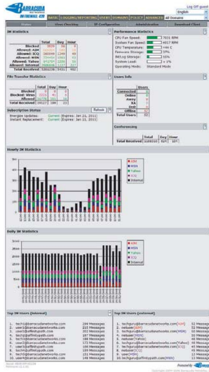
System Administrators can use the intuitive Web interface for detailed monitoring and maintenance.

Whether your internal IM plans require managing public IM traffic, or require installing an internal IM server and client, the Barracuda IM Firewall has your IM needs covered. The Barracuda IM Firewall provides tools to manage public IM traffic, as well as an integrated IM server and client to provide a secure internal IM network for your organization.